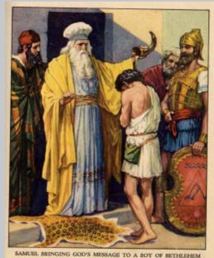
SAMUEL BRINGING GOD'S MESSAGE TO A BOY OF BETHLEHEM

13 So Samuel took the horn of oil and anointed him in the presence of his brothers, and from that day on the Spirit of the LORD came upon David in power.