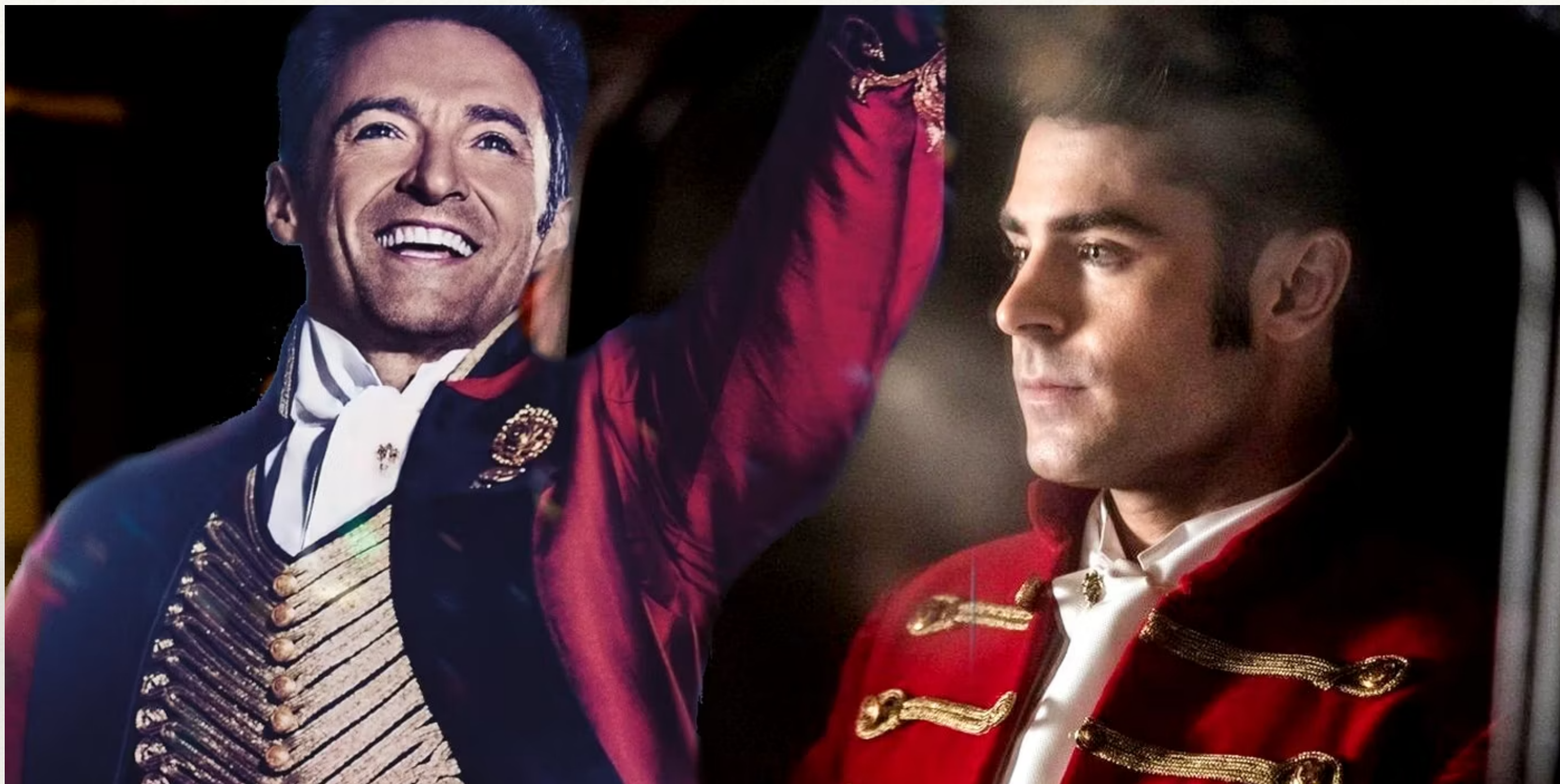
“The Greatest Showman”