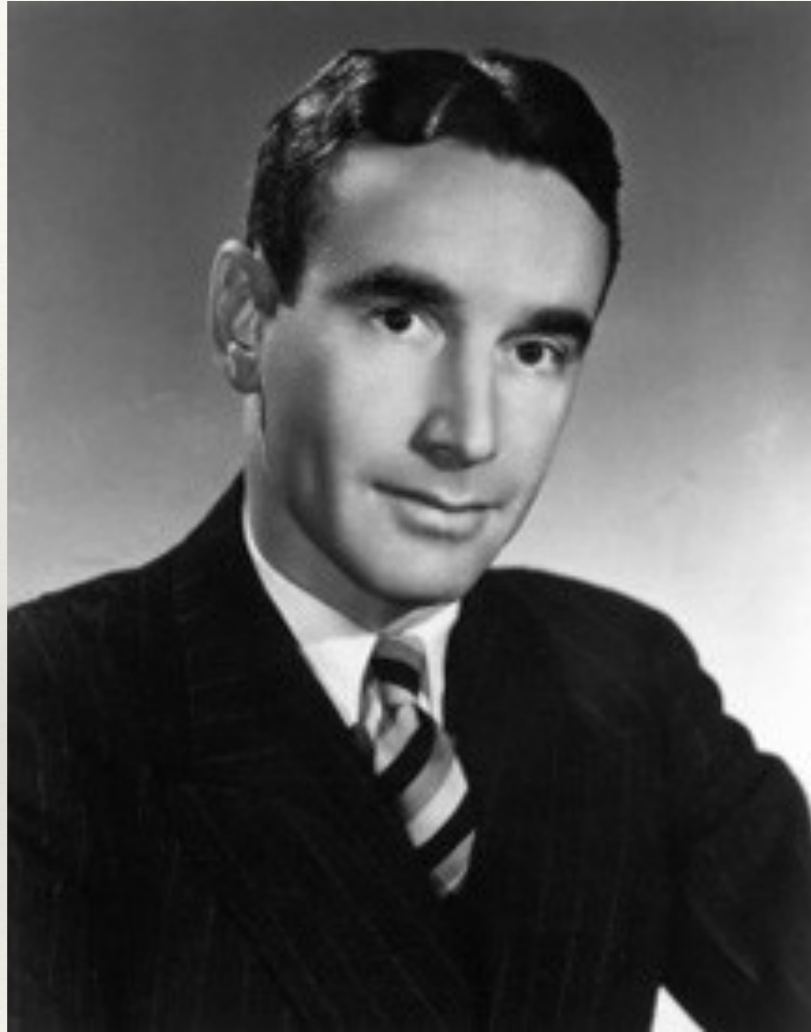
Robert L May 1905 - 1976